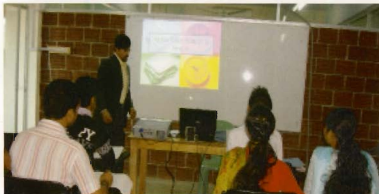
Students being imparted lesson in the Language School with the help of Modern Technologies

English Language School of Prime University has started the classes of the 7 th batch after successful completion of the 6 th batch of students. The English Language program has been appreciated from every corner. Since its inception, it has continued its run with steady of success. We hope the Language Learning Programme of the 7 th batch will add to the credit of the school.