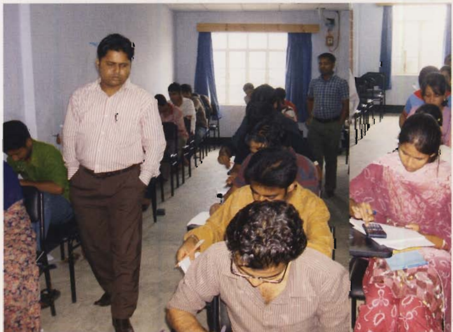
Students taking exam in the exam hall

The invigilators discharged their duties with utmost sincerity and honesty. The exam halls were free from all sorts of irregularities, copying and cheating.