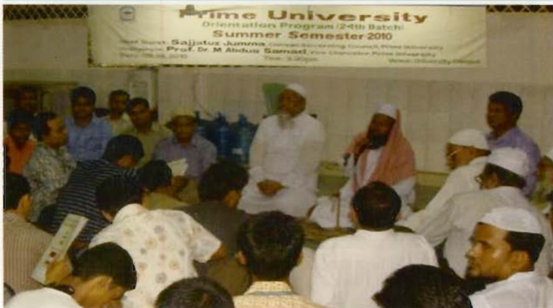
A view of the 'Doa Mahfil' on the day of Orientation

An orientation and reception program was arranged at the University campus on the 5 th of June, 2010 to welcome the 24 th batch of newly admitted students.