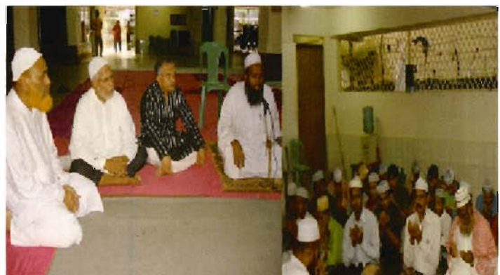
National Mourning Day-2010

It is also committed to keep good discipline among the students of the University.