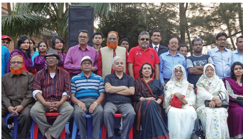
BOT Chairman, Members BOT, Vice Chancellor, Treasurer, Chairmen of different departments, Controller of Examinations, faculty members, executives along with spouses of V.C. and BOT members at the picnic spot

Like yester years, students, faculties and staffs of Prime University had a grand day as they enjoyed a picnic on February 26, 2014. It was spring semester, 2014. Nature lavishly furnished soothing fervor. Everybody in the university was enthusiastic to have a gala day for savoring a temporary relief from the routine activity. The spot was selected and finalized earlier. It was Shohag Polli in Gazipur, a popular picnic spot surrounded by trees and known for its natural beauty. The students with the guidance of teachers of every department started their journey early in the morning. The day was sunny enough to feel the freshness of the