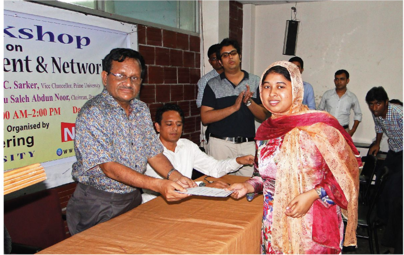
A student receiving certificate at the end of the workshop from the Chairman of the dept. of ETE and CSE