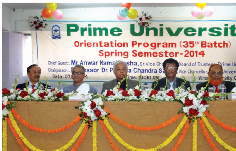
Members of the Board of Trustees, Vice Chancellor and Treasurer at the dais in the orientation program

The orientation program of the newly admitted students for Spring Semester 2014 in different graduate programs of Prime University was held at the University Campus, Mirpur-01 on February 07, 2014.