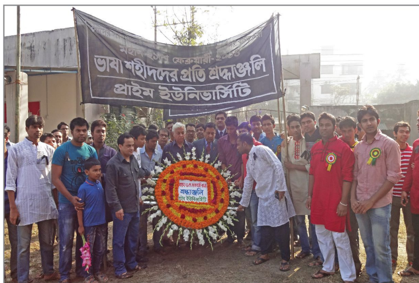
Vice Chancellor, Registrar, Chairmen of different departments along with faculty members and students on their way to placing floral wreath

21st February is a day of national mourning and rededication. It is the Language Martyr's Day. On this day in 1952, Barkat, Rafiq, Shafiur, Jabbar, Salam and many others sacrificed their young precious lives for the honour and preservation of mother tongue, Bangla. It is the first milestone that marked the sowing of the seeds of our War of Independence of 1971.