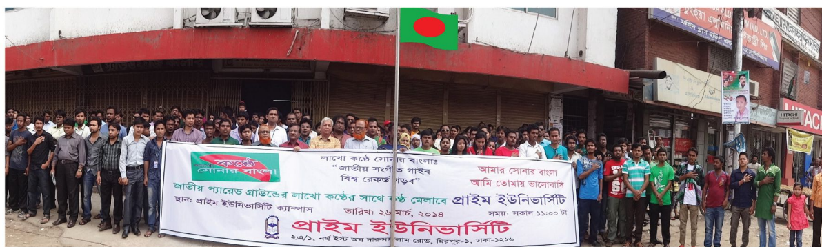
Vice Chancellor and Treasurer along with faculty members executives and students of Prime University waiting in front of the campus to join in to make record

On March 26, Bangladesh has been listed in the Guinness World Record for singing the national anthem by 2, 54,537 people at the National Parade Ground on her 43rd Independence Day. It was organized by the Ministry of Cultural Affairs, Government of the People's Republic of Bangladesh. Prime University has become the part of this grand occasion. As the clock struck 11:20 am, a large group of students of Prime University joined the event by singing "Amar Shonar Bangla-Ami Tomay Bhalobashi"