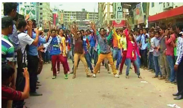
A flash mob presentation by PU students

B angladesh hosted ICC T20 World Cup and the cricket fever virtually caught the cricket lovers throughout the country. As the effect of it, the theme song of the tournament "Char Chokka Hoi Hoi" had created quite a buzz among the students of different levels across the country where