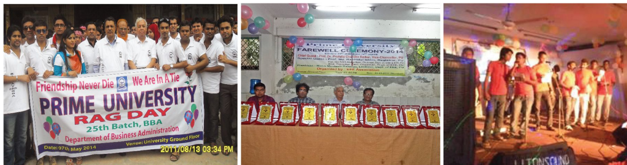
Outgoing students of BBA department along with Vice Chancellor, Treasurer, Registrar and Chairman (left); Vice Chancellor, Chairmen and a Faculty Member at the dais on the farewell ceremony of EEE department (middle); students performing on stage on the farewell ceremony of Law department (right)

R ag day plays a vital role in the life of a student. As an outgoing student, the day may bring sadness to him. On the other hand, he prepares himself to step outside the class room for the first time to create a place of his own in this world with his knowledge and work. Department of Electrical & Electronic Engineering, Department of Business Administration and Department of Law celebrated rag day to bid their course completiny students farewell.