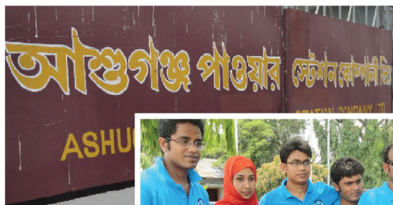
The students at the power plant station

the transmission techniques properly. There were three engineers of Ashuganj Power Station Company Limited with the students to guide them. They described everything to the students clearly. In addition, they answered different questions asked by the students. Students paid their attention to the words of their guides and noted down the important points. On the return journey the students spent some time at Bhairab Bridge. Indeed it was a day full of learning as well as joy for the students.