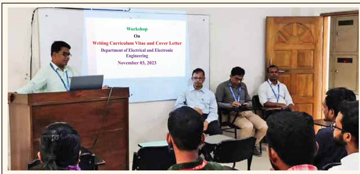
CV & cover-letter writing workshop at the Department of EEE