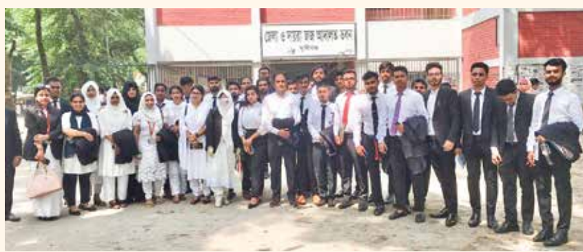
Teacher and students of the 52 nd batch Department of Law are in front of the court of District and Sessions Judge, Munshiganj in the court visit program