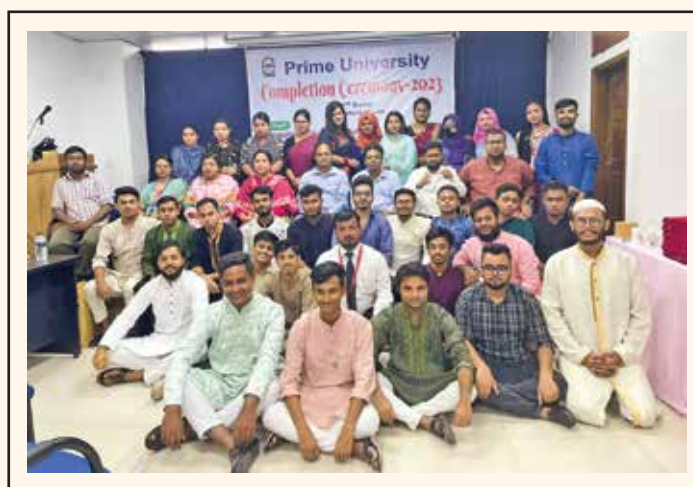
Teacher and students of the 52 nd batch Department of Law in the Completion Ceremony-2023