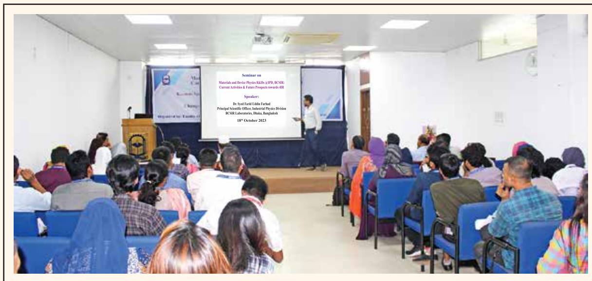
The Keynote Speaker of the seminar delivering speech