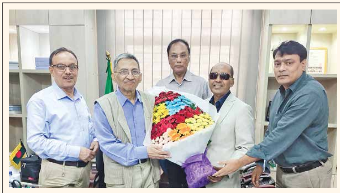
UGC chair congratulated by Prime University Board of Trustees on his second term appointment