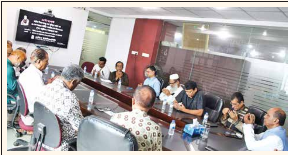
Remembering the 48 th Martyrdom Anniversary and National Mourning Day at Prime University

During the discussion, speakers shed light on various facts of the life of the Father of the Nation, Bangabandhu Sheikh Mujibur Rahman, and underscored his enduring ideals. Furthermore, they highlighted his exceptional contributions to the achievement of Bangladesh's independence and urged the new generation to ardently pursue the realization of Bangabandhu's vision of a prosperous Bangladesh.