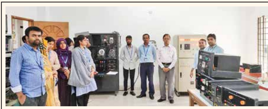
A new Power System and Protection Lab for the Department of EEE

The University authority has demonstrated a profound dedication to academic excellence, ensuring that Prime University remains at the forefront of innovation and education. Their support in the establishment of this lab highlights their commitment to fostering a learning environment that empowers students and faculties alike. It is their forward-thinking approach that has made this remarkable endeavor possible, providing students with practical skills and enhancing research opportunities.