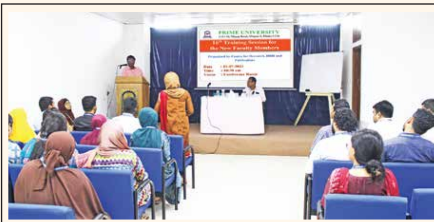
A view of the training session

A two-day training program followed by demo presentations of the newly appointed faculty members took place from 31 st July 2023 to 7 th August, 2023 in the Prime University premises. The training program was organized by the Centre for Research HRD & Publications (CRHP) of the University. Twenty eight faculty members from different departments participated in the program. These sort of training sessions are organized regularly to develop the teaching and other professional skills of the faculty members.