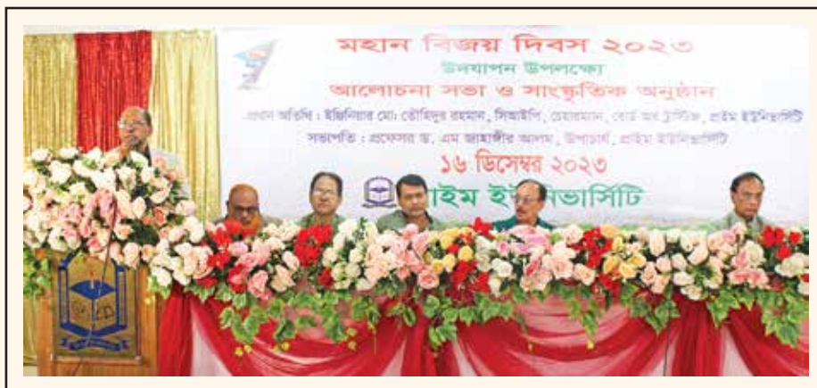
The Chairman of Board of Trustees delivering speech at the discussion session of the Victory Day 2023

Prime University observed Victory Day on December 16, 2023 with solemnity to pay tribute to the martyrs of the liberation war. To observe the day, Prime University sketched out elaborate programs including placing floral wreaths, a discussion session and a cultural program.