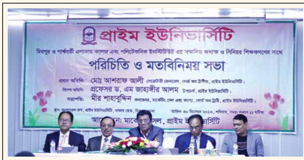
A view of the dais of the program

the infinite energy of the young people and also laid importance on conducting research to enhance the knowledge and innovations of students. The guests thanked the chairperson for organizing such a coordination meeting at Prime University.