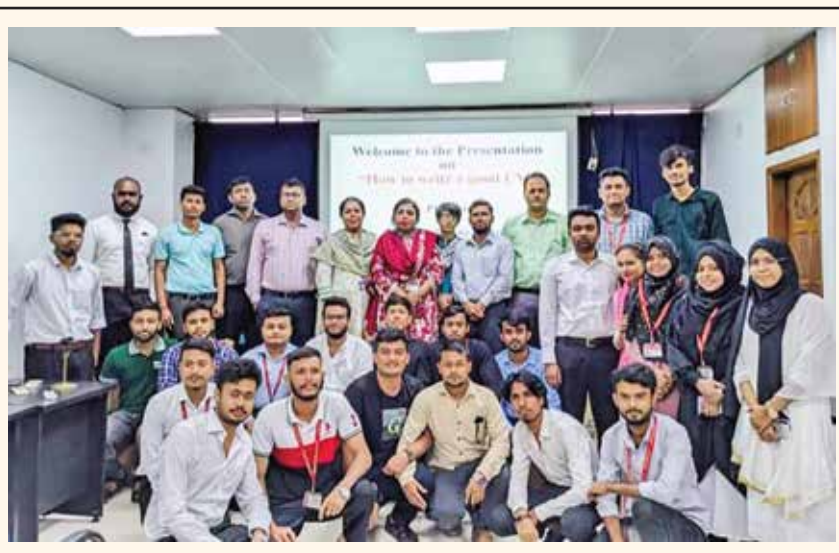
Teacher and students of the Department of Law in the Workshop program on "How to Write a Good CV"