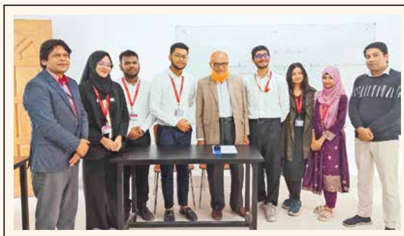
Director and Faculty Members with Debators