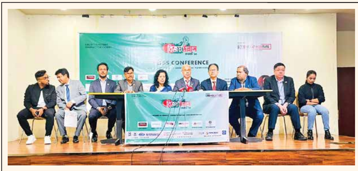
A view of press conference